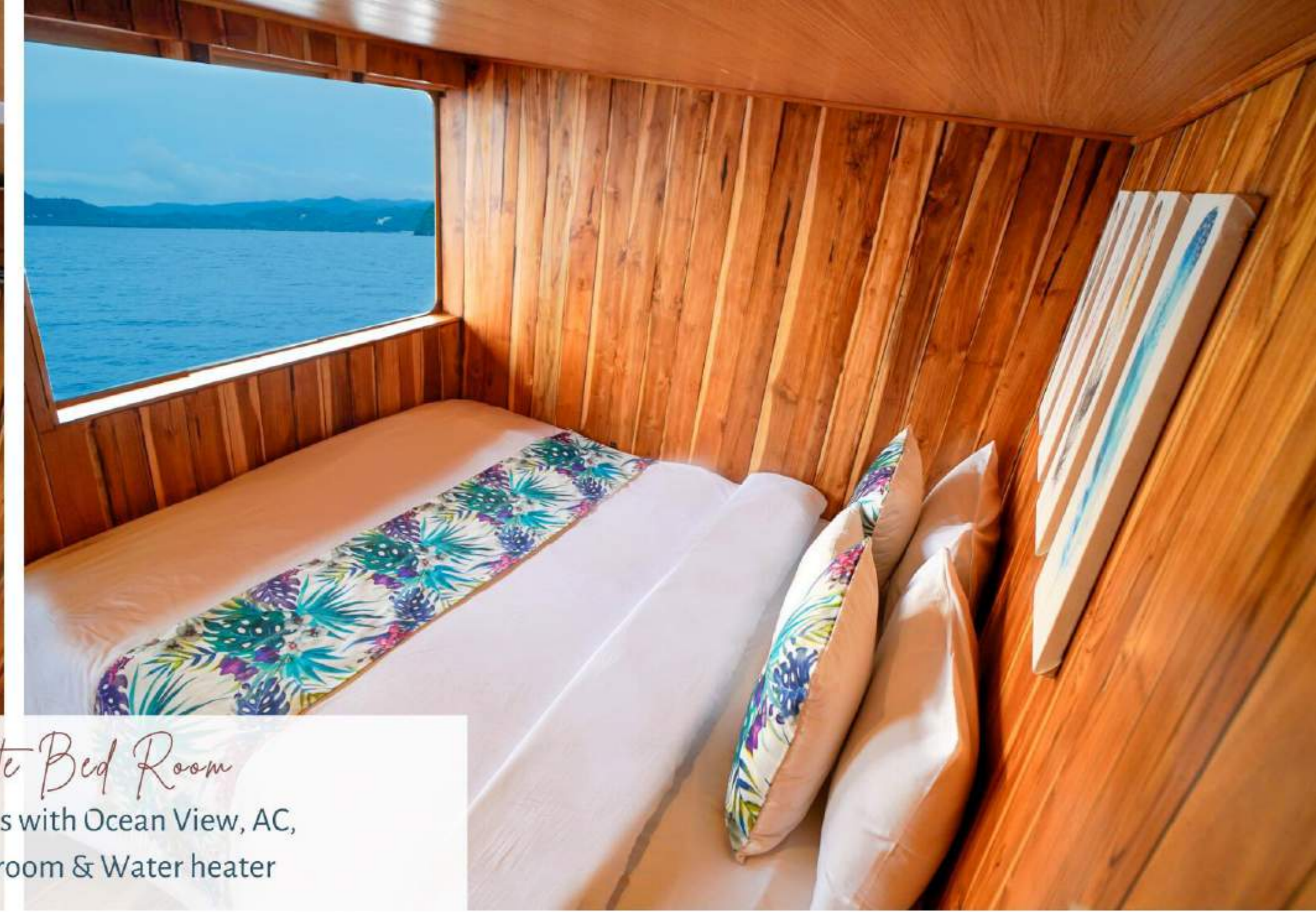
Private Bed Room 6 Private cabins with Ocean View, AC, Private bathroom & Water heater