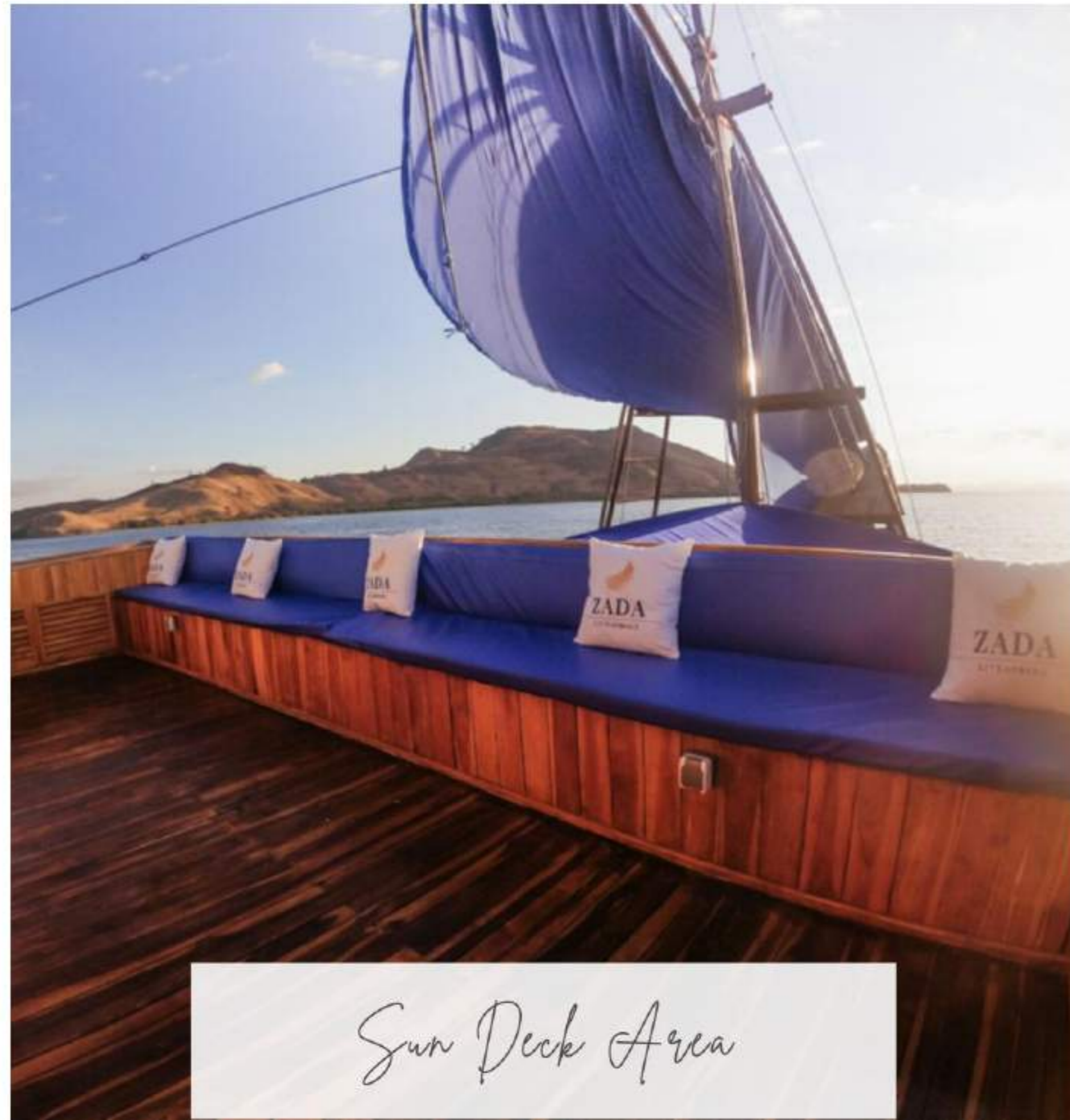
Sun Deck Area