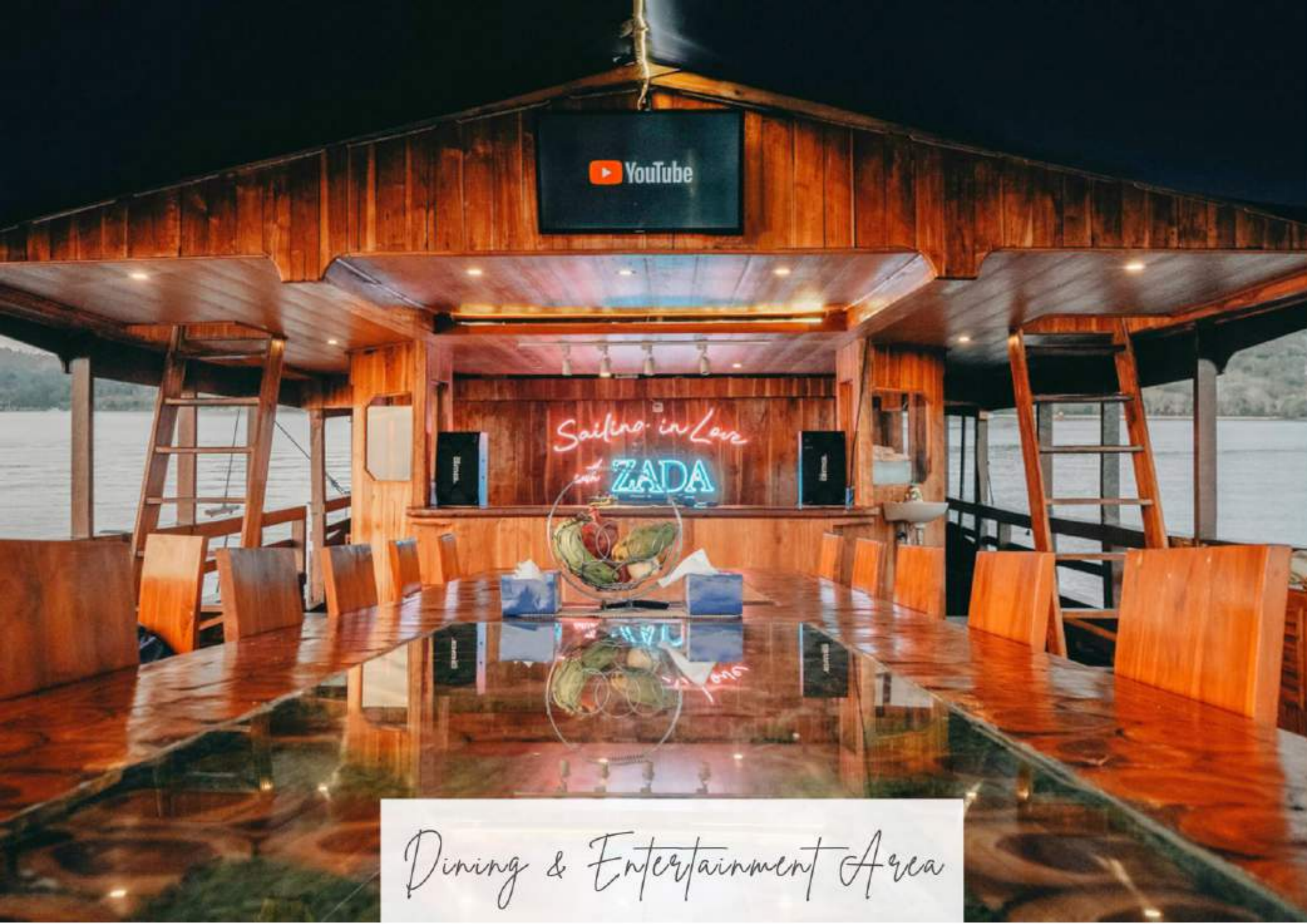
Dining & Entertainment Area